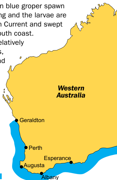
Range of western blue groper in WA

The western blue groper is found all the way from Geraldton down the west coast and almost as far east as Melbourne, in waters from five to 65 metres deep. Western blue groper spawn between winter and spring and the larvae are caught up in the Leeuwin Current and swept eastwards along WA's south coast. Juveniles often inhabit relatively shallow protected waters, such as inshore reefs and seagrass meadows. As blue groper get older, they tend to venture into deeper water around offshore reefs.