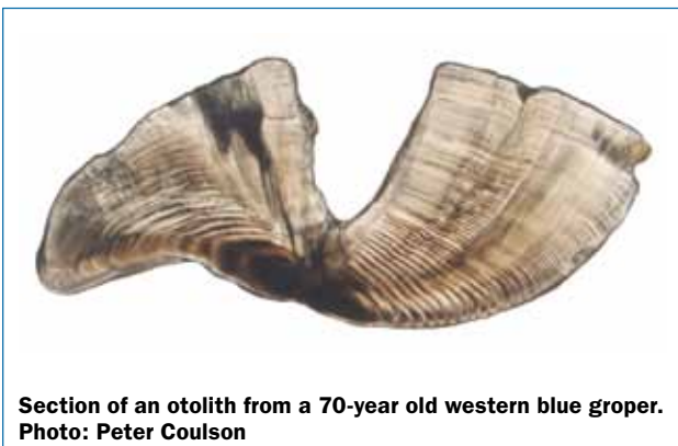
Section of an otolith from a 70-year old western blue groper.

The otoliths, used by fish to balance and hear underwater, lay down growth rings every year in a similar manner to tree trunks. Researchers count the growth rings to build a picture of the abundance of each 'age class' in the population of a fishery. This information is used to gain an understanding of the impact of fishing on the stocks of species.